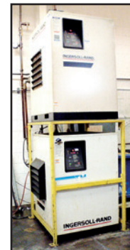
Ingersoll Rand Tm300T Refrigerated Air Dryer