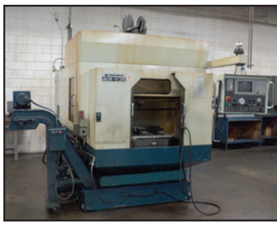
Daewoo Mdl. ACE-V35 CNC Vertical Machining Center

(2) Tornos Bechler Mdl. Deco 20/25.4 CNC Automatic Screw Machines, Fanuc PNC-DECO CNC Control, 10,000 RPM, 25.4mm (1") synchronous rotary guide bushing, motorization S3 and S5, includes: misc tooling, Tornos ROBOBAR SSF-532/4200 auto bar loader, S/N: 40-110-925, Mayfran chip conveyor, mist collector, hour meter: 12,724, S/N's: 1895 (2000); hour meter 11,288 1896 (2000)