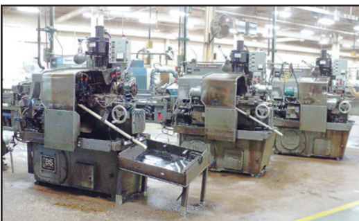
(3) Brown & Sharpe #2 Ultramatic R/S Automatic Screw Machines

(3) Brown & Sharpe #2 Ultramatic Automatic Screw Machines, complete with Lipe barfeeder, S/N's: 542-8545-(1-1/4); 542-7559-(1-1/4); 542-7533-(1-1/4)