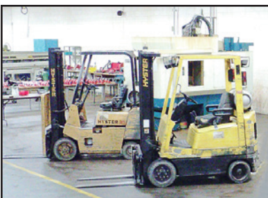
Partial View of Forklift Trucks

Corbel 1/2-Ton Capacity Overhead Bridge Crane, 20' x 25'