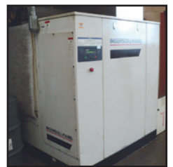
Ingersoll Rand SSR-EP75 Rotary Screw Type Air Compressor