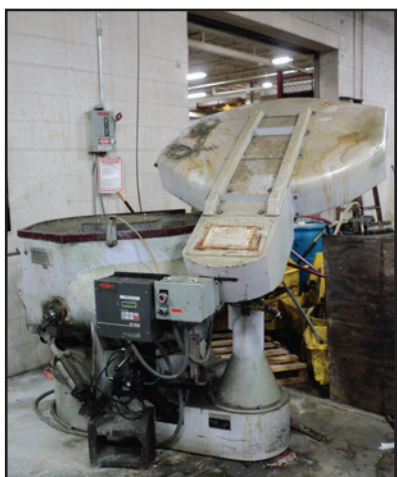
Rapid Finishing Mdl. RF-10 Vibratory Bowl Finisher

(3) Brown & Sharpe #2 Ultramatic Automatic Screw Machines, complete with Lipe barfeeder, S/N's: 542-8545-(1-1/4); 542-7559-(1-1/4); 542-7533-(1-1/4)