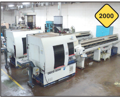
(2) Tornos Bechler Mdl. DECO 20/25.4 CNC Automatic Screw Machines

ENTER AUCTION DETAILS Click Here For Full Details