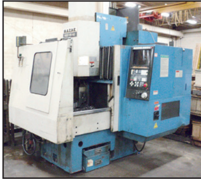
Mazak Mdl. VQC-15/40 CNC Vertical Machining Center