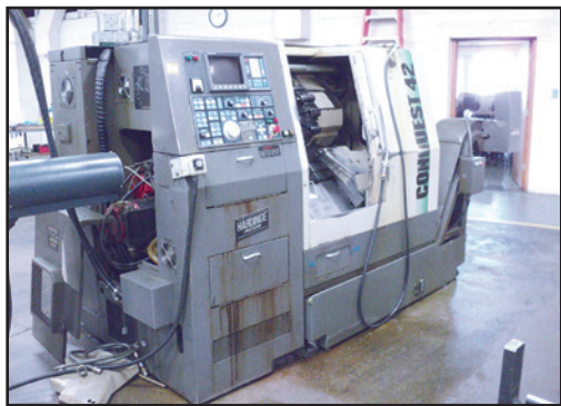
Hardinge Conquest 42 CNC Slant Bed Chucker