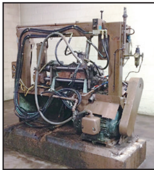
Barber-Coleman Mdl. 6-10 Gear Hobbing Machine

(4) Hardinge Conquest CS42 CNC Slant Bed Chuckers, GE Fanuc OT controller, live tools (original sub spindle removed), collet chuck, 12-position tool turret, 1.875" hole through spindle, 16C collet with 1.625" bar cap, 10HP drive motor, spindle speeds 50-5,000 RPM, capacities: max. swing over upper way cover = 19.5", max. swing over lower way cover = 14.5", max. distance from spindle face to turret face = 14", travels with 12-station turret: X=5.5", Z=13.650", turbo chip conveyor, power: 208-230/3/60, includes: LNS model HYS 6.42-HS-5.2 Hydrobar barfeed, (1) with live tooling, S/N: 29-848, S/N's: CS-354; CS1390C; CS-456; CS-145