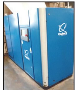
Quincy Mdl. QGV-60 Rotary Screw Type Air Compressor