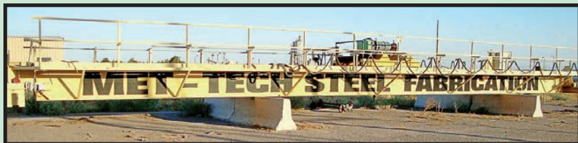
GAFFEY 10 T. X 70' SPAN X 160' L. TOP RUNNING DOUBLE GIRDER FREE-STANDING OVERHEAD BRIDGE CRANE SYSTEM

BIDS START CLOSING ON TUESDAY, DECEMBER 16 AT 10:00 A.M.