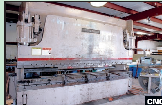
CINCINNATI FORMASTER II 3000 T. CAP. X 16' CNC HYDRAULIC PRESSBRAKE