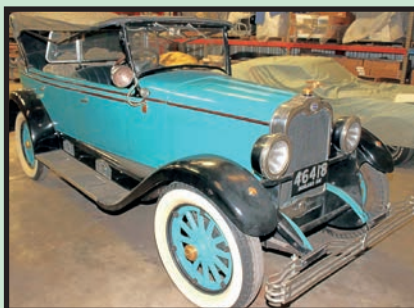
1926 OAKLAND 4-DOOR SPORT PHACTON RARE ANTIQU AUTOMOBILE

SEE OUR HUGE VIRTUAL BROCHURE ON OUR WEBSITE AT www.pmi-auction.com FOR SPECS, PHOTOS, LOCATIONS & INSPECTION INFO