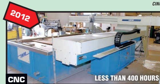
I.W.M. 6' X 13' CUTTING CAP. CNC WATERJET CUTTING MACHINE