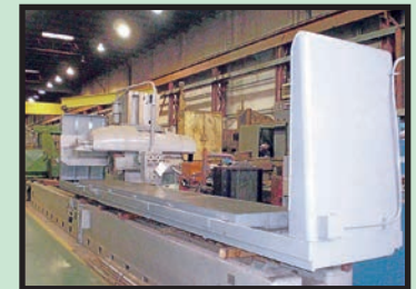
THOMPSON 36" X 240" LARGE CAPACITY HYDRAULIC SURFACE GRINDER

SEE OUR HUGE VIRTUAL BROCHURE ON OUR WEBSITE AT www.pmi-auction.com FOR SPECS, PHOTOS, LOCATIONS & INSPECTION INFO