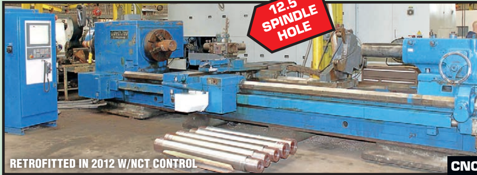
AMERICAN 46" X 180" LARGE CAPACITY CNC HOLLOW SPINDLE LATHE