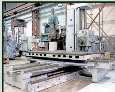
WOTAN 5-1/8" HORIZ BORING MILL

MACHINE TOOLS: CNC Hollow Spindle Lathes, incl. American 12.5" Hole Retrofitted 2012 • CNC 6-Axis Gun Drill • Horiz. & Vert. Boring & Milling Machines • Jig Mills • Large Cap. Hone & Grinders • E.D.M. • Engine & Hollow Spindle Lathes • Radial Drills • Accessories • Tooling • More. FABRICATING EQUIP.: CNC & Manual Press Brakes & Bending Dies • CNC Waterjet Cutting Machine (2012) • Plate Shears • Ironworker • Cut-to-Length Line • Welding • Plasma • More. MATERIAL HANDLING: Overhead Bridge Cranes, up to 150 T. x 86' span x 53' lift ht. • 10 T. X 70' span x 160 Gantry Crane System • Forklifts up to Taylor 52,000 lb. • Galion 15 T. Hyd. Telescoping Crane • Magnetic Lifters • Hoists. RAW MATERIAL: Sheet Metal • PARTS INVENTORY • PROCESSING: Vacuum Pump Liquid Extraction Ring. PLANT SUPPORT: Compressors • Work Tables • Fans • Heaters • Shelves. 1926 OAKLAND RARE ANTIQUE AUTOMOBILE • FURNITURE • MORE