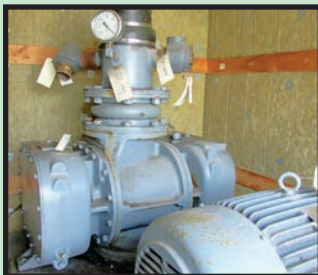
PARTIAL VIEW OF VACUUM PUMP LIQUID EXTRACTION RING PACKAGE

Presorted First Class Mail U.S. Postage PAID Eugene, Oregon Permit No. 17