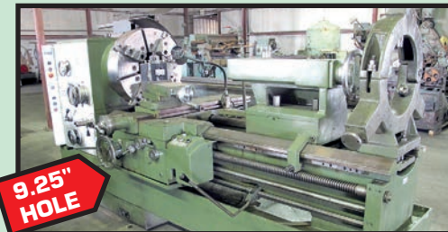
LANSING 28" X 60" HOLLOW SPINDLE LATHE