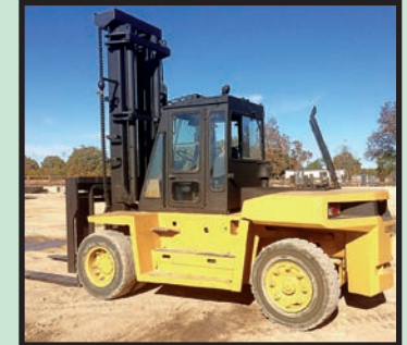
CATERPILLAR 30,000 LB. CAP. MDL. DP135 LARGE CAPACITY FORKLIFT