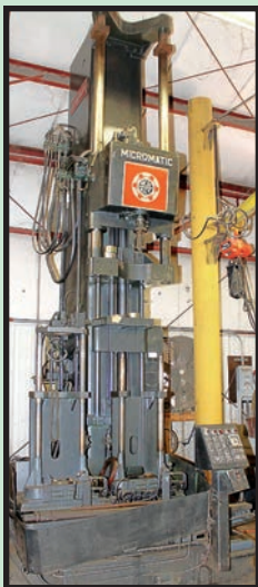
MICROMATIC MDL 15V65 LARGE CAPACITY VERTICAL HONE