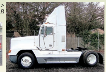
1999 FREIGHTLINER FLD120 DAYCAB