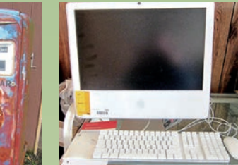
APPLE 20 IMAC