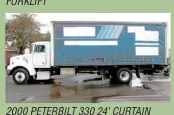
2000 PETERBILT 330 24' CURTAIN SIDE BOX TRUCK