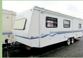
1998 PROWLER TRAVEL TRAILER