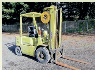
MITSUBISHI FG25 FORKLIFT