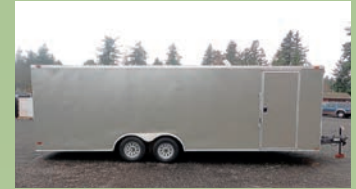
2012 8'6" X 24' ENCLOSED TRAILER