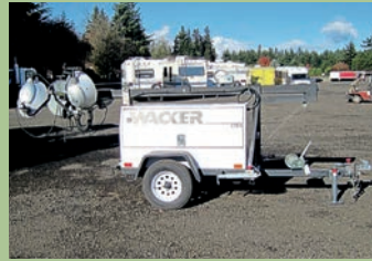
WACKER LTC4L LIGHT PLANT