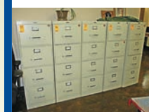
< FILE CABINETS