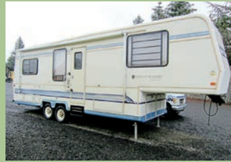
1993 ALUMALITE HOLIDAY RAMBLER TRAVEL TRAILER