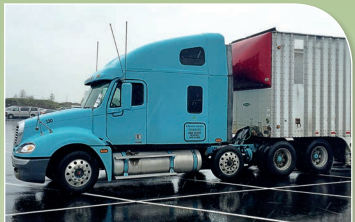
2006 FREIGHTLINER COLUMBIA