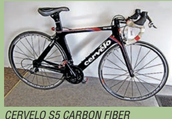
CERVELO S5 CARBON FIBER ROAD BIKE