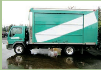
2006 FORD COE 16' BOX TRUCK