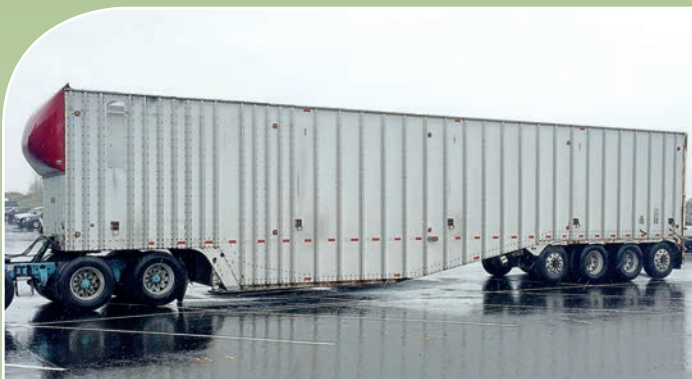
2000 PEERLESS 4-AXLE CHIP TRAILER

13231 SE Division St., Portland, OR 97236