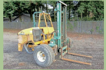
KESMAC 5000R PIGGY BACK FORKLIFT