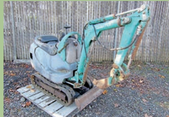
KOMATSU PC101 MICRO SHOVEL