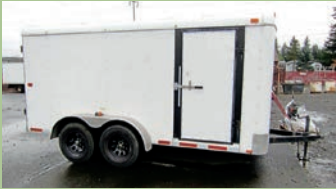
2009 INTERSTATE VICTORY 7' X 14' ENCLOSED TRAILER