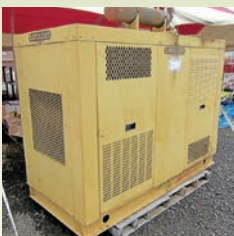
KATOLIGHT 65KW NATURAL GAS GENERATOR

MORE INFORMATION & PHOTOS AT www.CIAUCTIONS.com