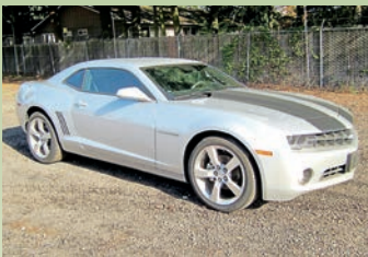
2011 CHEVROLET CAMARO RS W/37K MILES

HEAVY EQUIPMENT – TRUCKS – TRAILERS – CARS – TOOLS U.S. MARSHAL'S SEIZED PROPERTY – BANKRUPTCY ITEMS