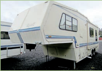
1993 ALPENLITE TRAVEL TRAILER