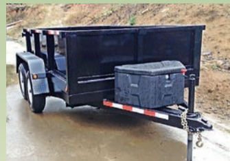
(1 OF 3) 2013 FABFORM DUMP TRAILERS