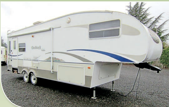
2005 KEYSTONE OUTBACK TRAVEL TRAILER