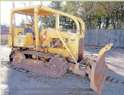
< CATERPILLAR D4E DOZER

HEAVY EQUIPMENT – TRUCKS – TRAILERS – CARS – TOOLS U.S. MARSHAL'S SEIZED PROPERTY BANKRUPTCY ITEMS