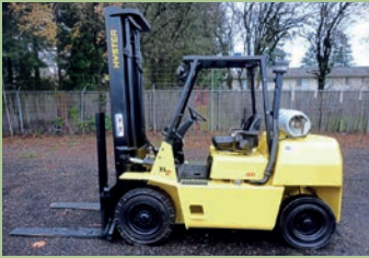
HYSTER H80XL LPG FORKLIFT