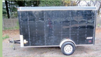
2008 PACE 6' X 12' ENCLOSED TRAILER