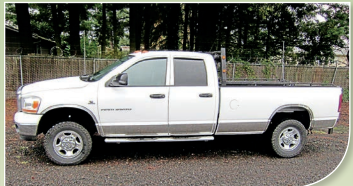
2006 DODGE RAM 3500 4X4 DIESEL PICKUP