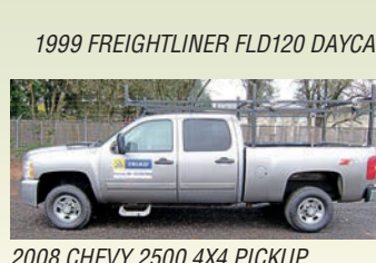
2008 CHEVY 2500 4X4 PICKUP