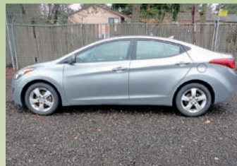
2007 HYUNDAI ELANTRA W/55K MILES