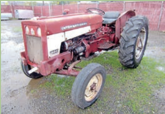
INTERNATIONAL 424 DIESEL TRACTOR