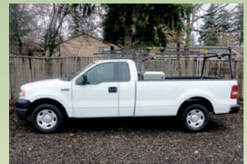
(1 OF 4) 2006 & 2007 FORD F-150 PICKUPS

MORE INFORMATION & PHOTOS AT www.CIAUCTIONS.com