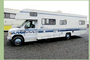
1996 JAMBOREE SPORT MOTOR HOME