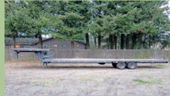
2009 KAUFMAN 50' GOOSENECK TRAILER