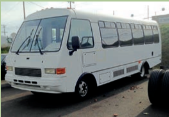
1997 FREIGHTLINER SHUTTLE BUS