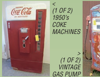
< (1 OF 2) 1950's COKE MACHINES